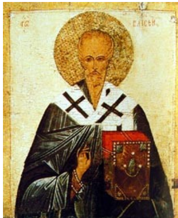
Hieromartyr Blaise, Bishop of Sebaste