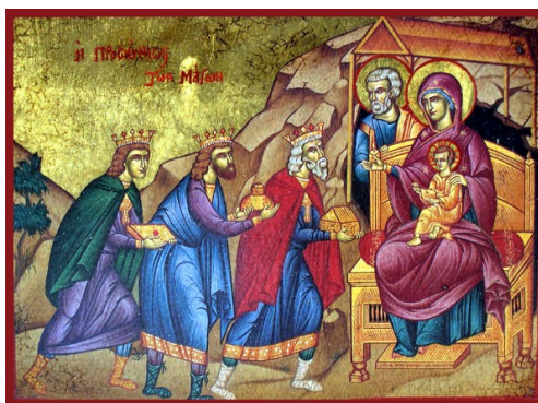
The Adoration of the Magi: Melchior, Caspar, and Balthasar