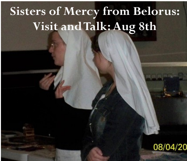
Sisters of Mercy from Belarus: Visit and Talk: Aug 8th